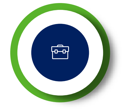
Encourage regional and international bodies support