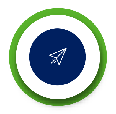
Continued support of UN-GGIM: Americas Board & Secretariat