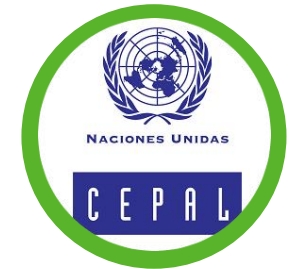
ECLAC Technical Secretariat