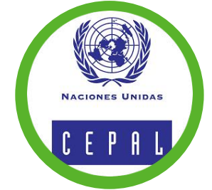
ECLAC Technical Secretariat